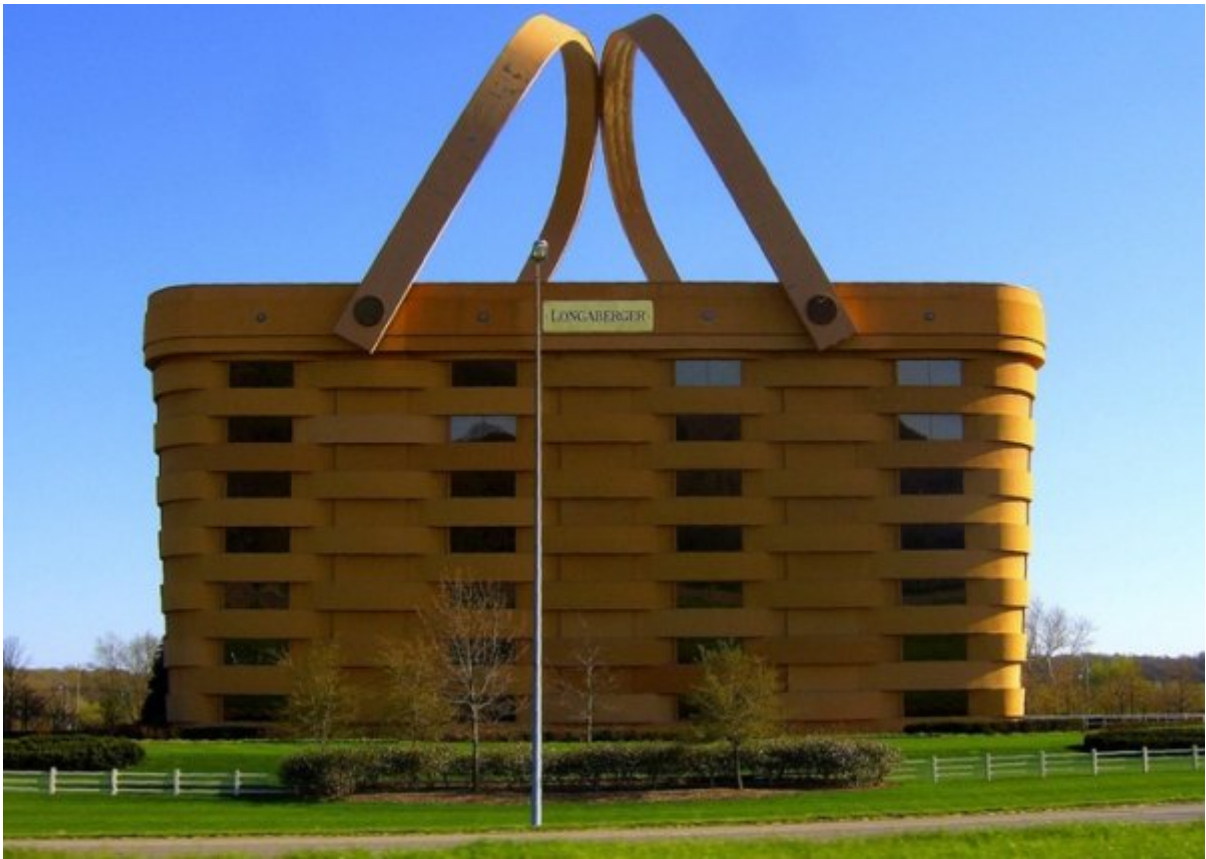
Wonderworks (Pigeon Forge, TN, USA)