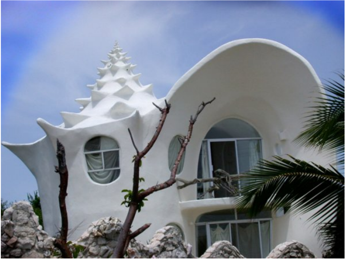
National Theatre (Beijing, China)