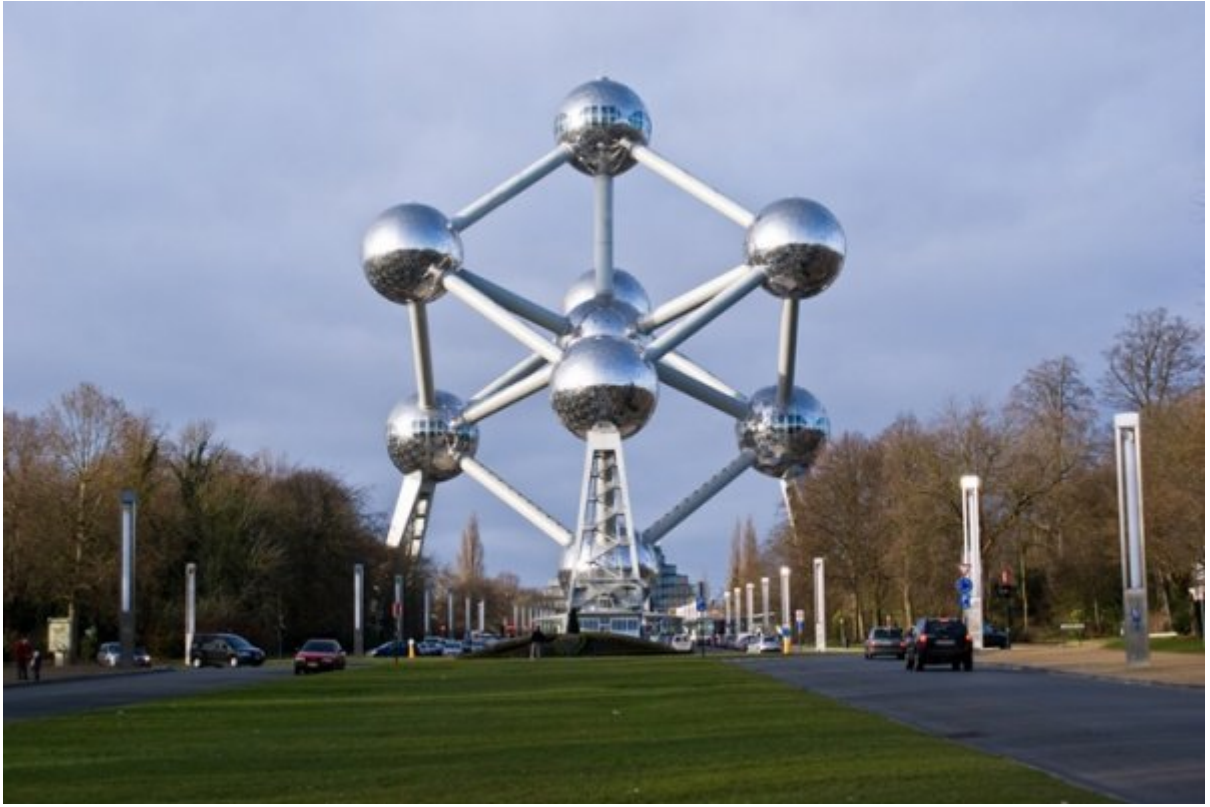
La Pedrera (Barcelona, Spain)