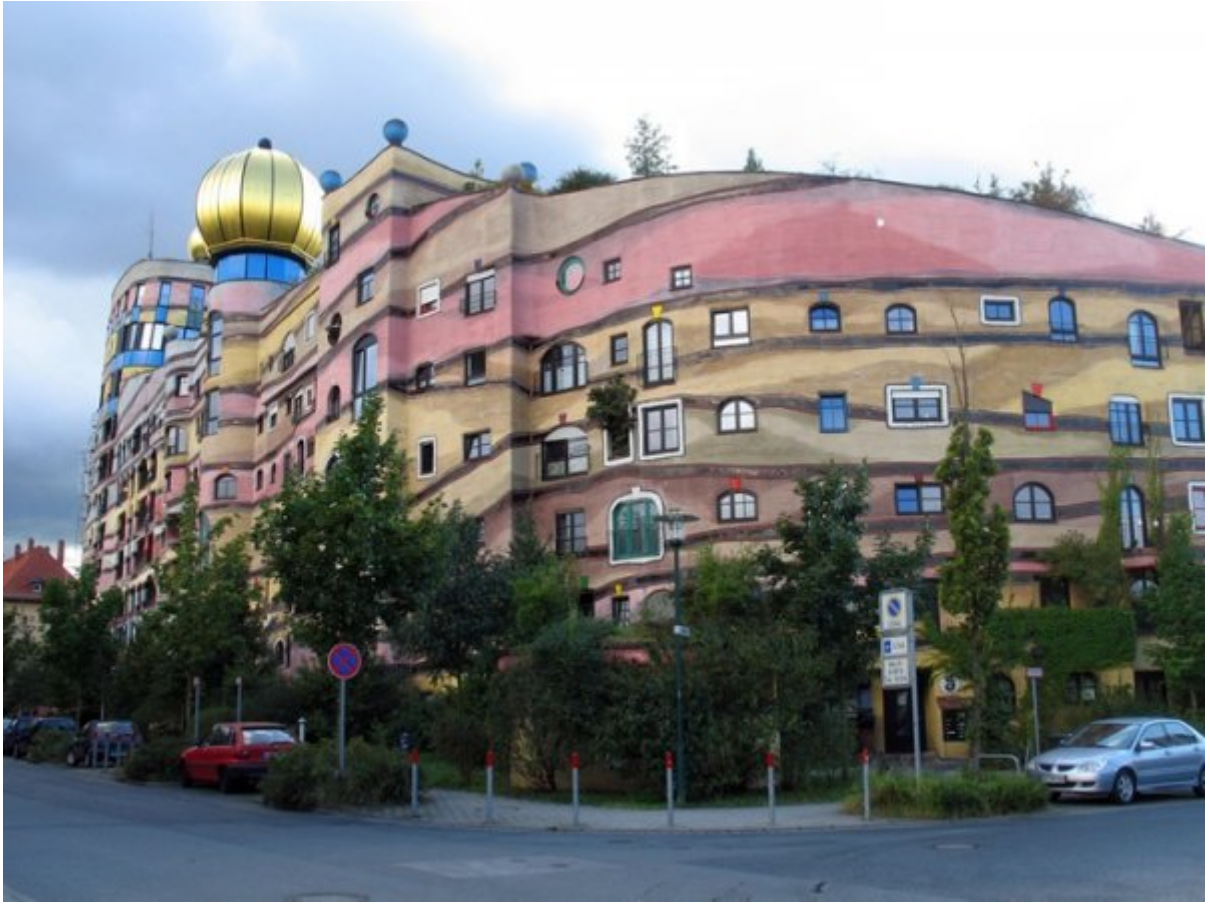
Kunsthhaus (Graz, Austria)