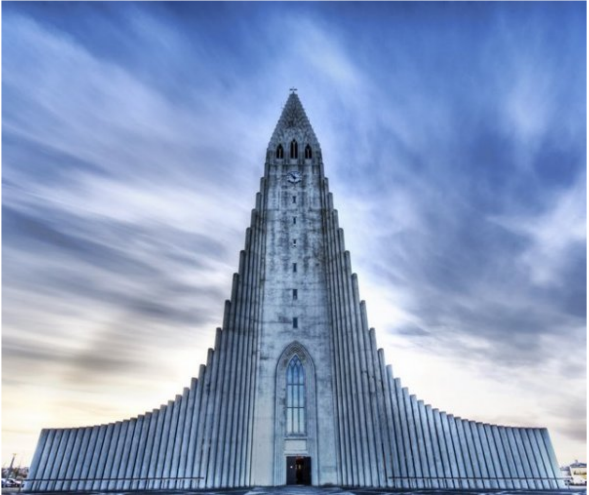
Ideal Palace (France)